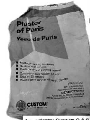
Plaster of Paris from Home Depot

Ingredients: Gypsum C.A.S. 1010-14-4, Limestone C.A.S. 1317-65-3. Ingredientes: Yeso C.A.S. 1010-14-4, Piedra Caliza C.A.S. 1317-65-3.